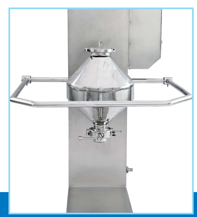
Single Pillar Mounted