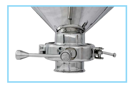
Sanitary Butterfly Valve