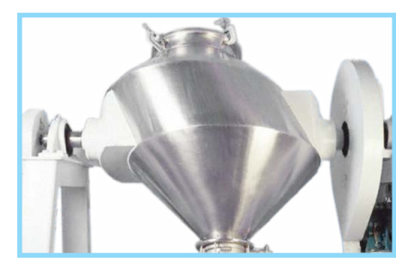
Asymmetric Double Cone Design