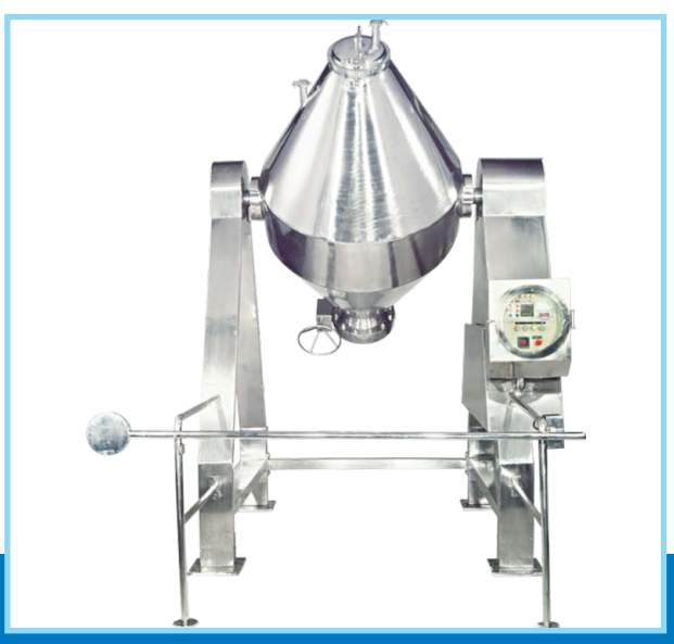
Double Pillar Mounted