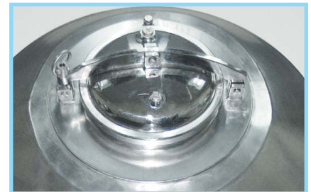
Hermetically Sealed Top Lid