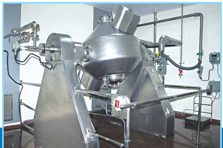
Control Parameter Pharma cGMP Application