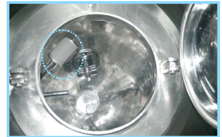
SS316L Sintered Filter Vacuum Nossel