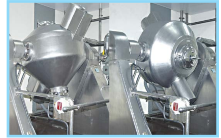
RCVD with Chopper Integration