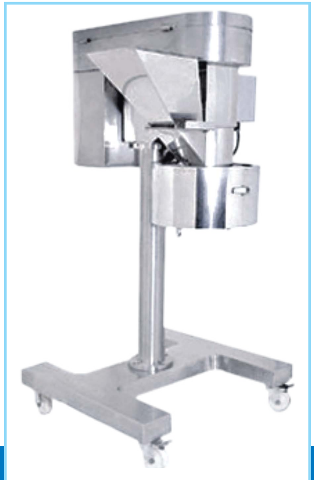
Multi Mill Mobile Model