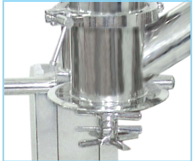
Knife and Hammer Blade Design