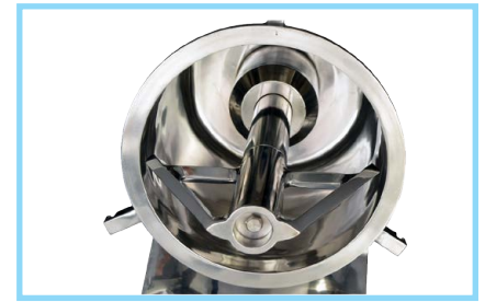
Sanitary Process Chamber Design