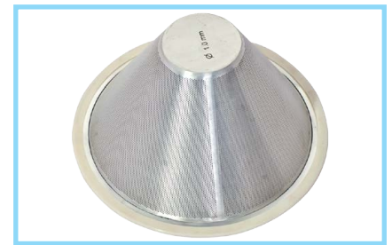
Special Design Sieve for Efficient Milling